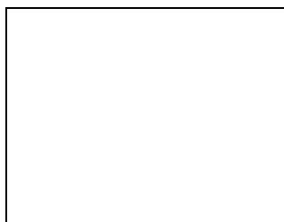
Photograph of Candidate

The signature and the photograph of the above- named Thiru/Tmt / Selvi..... are attested below