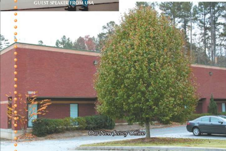
Our New Jersey Office