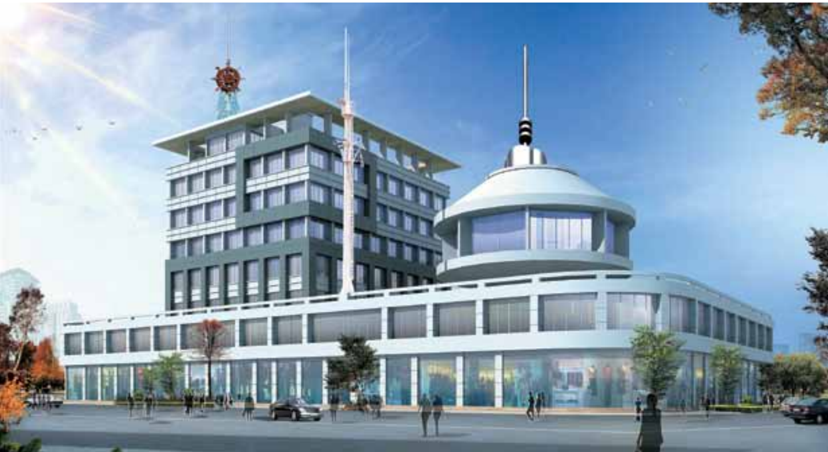
Academy view of C.B.D. Belapur Complex