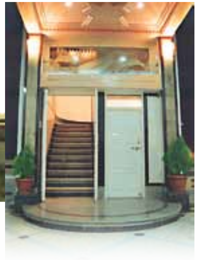
Canteen Facilities (Revolving Cafeteria) with 150 seating capacity at a time